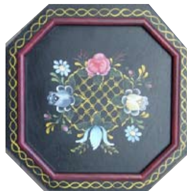
Octagon Wood Board (with raised inset trim) $12.00

If you are using your own surface, please note it should be 7"x7" or 8"x8" to fit pattern.