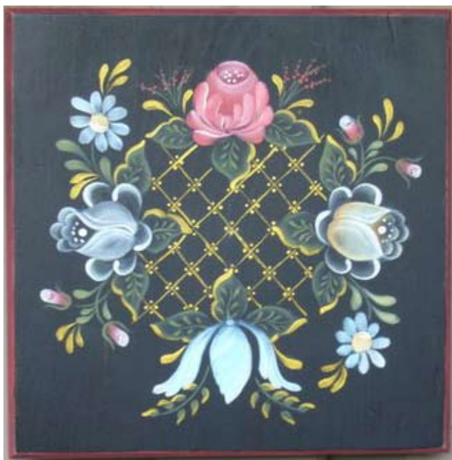
Wood Box with Lid - $12.00