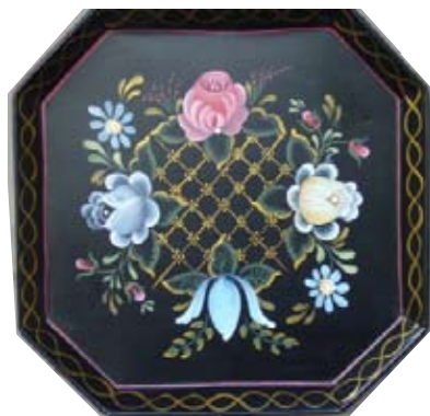
Metal Tray (cut corner square) $8.00